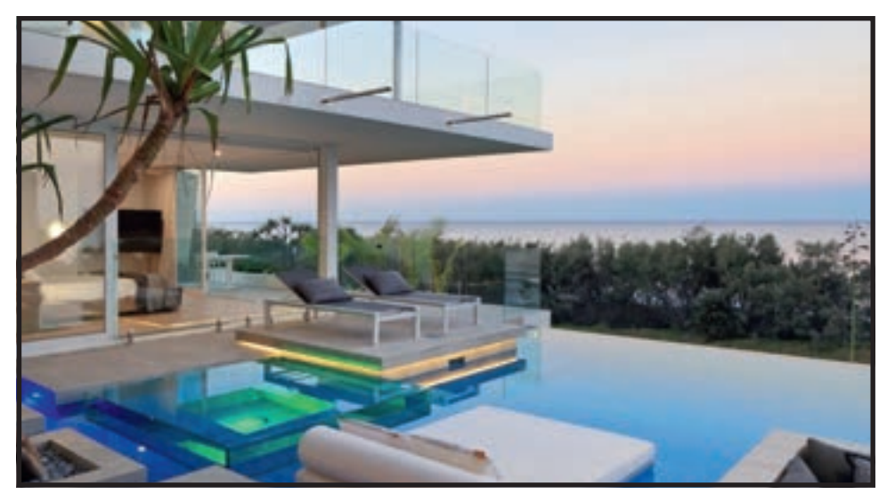
Paul Clout Design

The HIA-iLandscape Housing Awards Sunshine Coast/Wide Bay showcased stunning work by our region's housing design and construction industry.