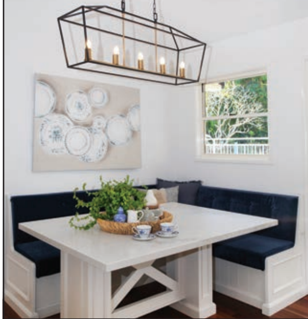
Kitchens By Bowen, Kitchen Renovation