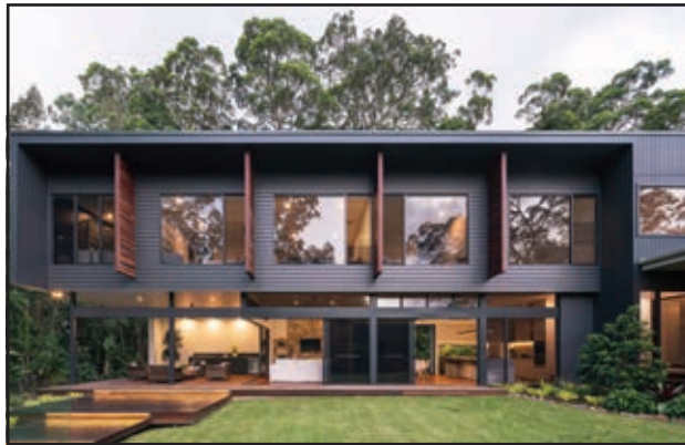
SX Constructions, Custom Build Home