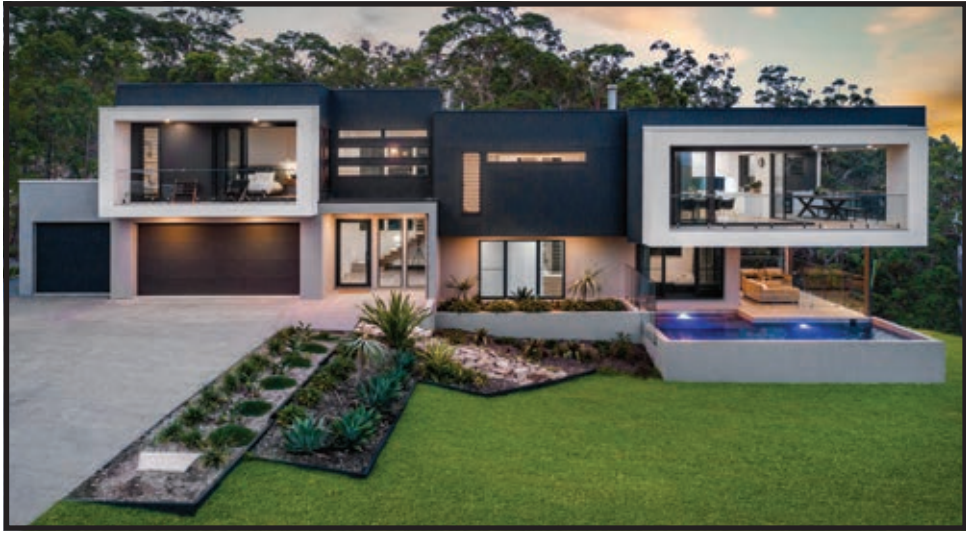
Grant McDonald Homes, Home of the Year

We take a look at the winners from the 2019 HIA-iLandscape Housing Awards Sunshine Coast/Wide Bay.