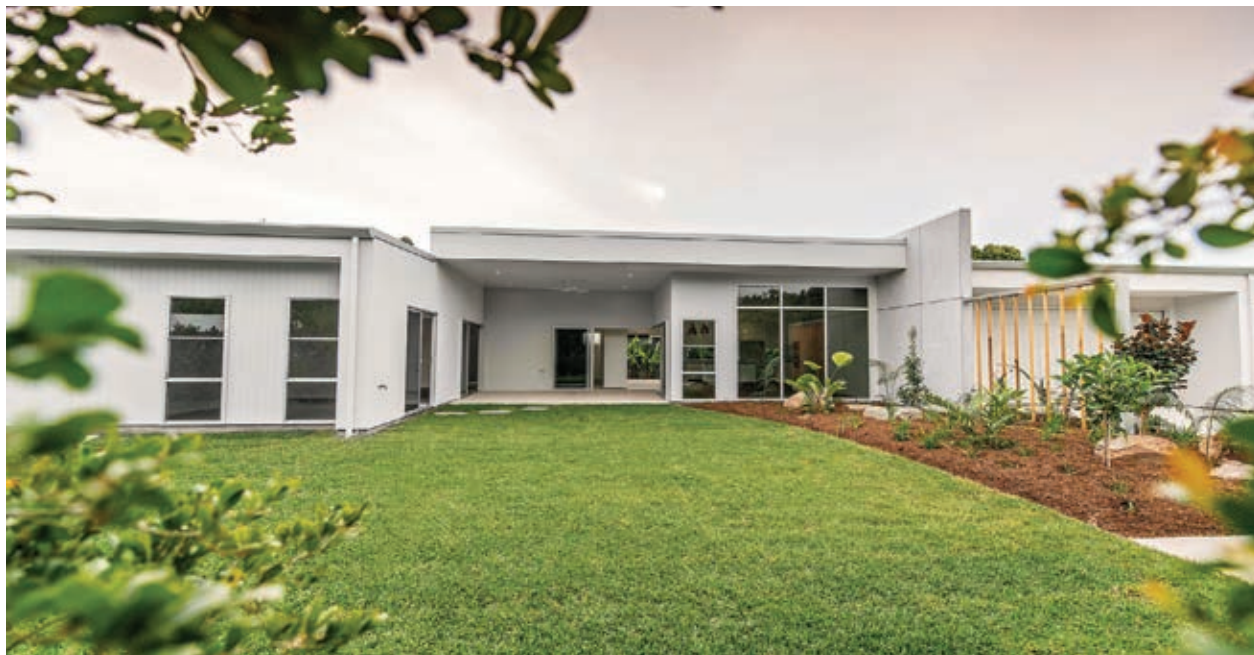
49a Helsham St, Point Vernon, Wide Bay, Essentially Residential

As judges we also take into account the site constraints, which can be a number of factors; steep site, limited access, small site and local government planning matters are most common. It's important to be aware of