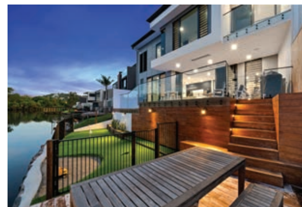
20 Banfield Plce, Sunshine Cove

The Sunshine Coast has a great record of winning the local and state awards. In 2018, our area won seven out of 10 state awards. The Sunshine Coast is experiencing a very busy period at this time in construction. The competition is healthy and the product on the Sunshine Coast is among the best in Australia. The local awards will continue with passionate and ethical volunteer judges continuing to choose the best of the best.