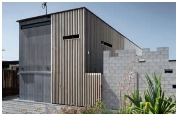
Banksia House, Kings Beach, Watt Building

A s a judge, I am looking for the quality in all aspects of the building balanced by the affordability of the dwelling. I also look closely at the workmanship of the building and the degree of difficulty that was overcome when determining the competition's winner.