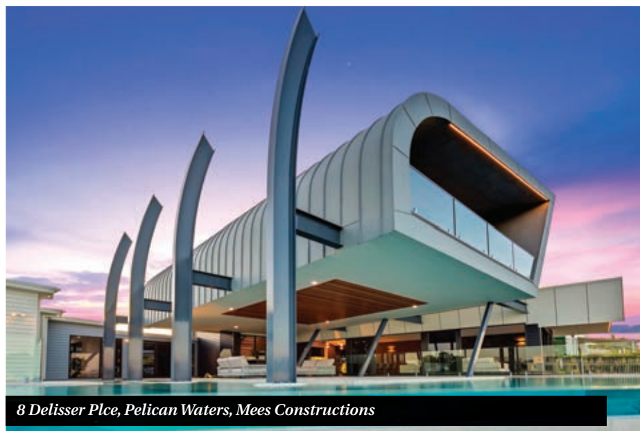
8 Delisser Plce, Pelican Waters, Mees Constructions

In a tough year of uncertainty and change triggered by the COVID-19 pandemic, the Housing Industry Association (HIA) is delighted to be holding its annual housing awards showcasing the excellence of Sunshine Coast and Wide Bay building and design on October 16.