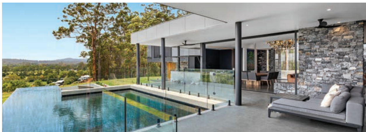
Gullos residence, Palmwoods, Accord Homes

Great design is important, as is a good use of natural light, airflow and open plan living areas designed to have those getaway zones for the modern family to use. As a judge, I look for the use of the latest technology, environmentally friendly and sustainable building practices. Innovation in the design of the floorplan or finishes used is always an interesting aspect of the judging. The variety of ideas and styling to create a home for 2020 were a joy to view and to admire the creative and innovative styling of our leading builders on the Sunshine Coast.