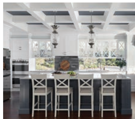
1 Entrance Island, Bokarina, SX Constructions