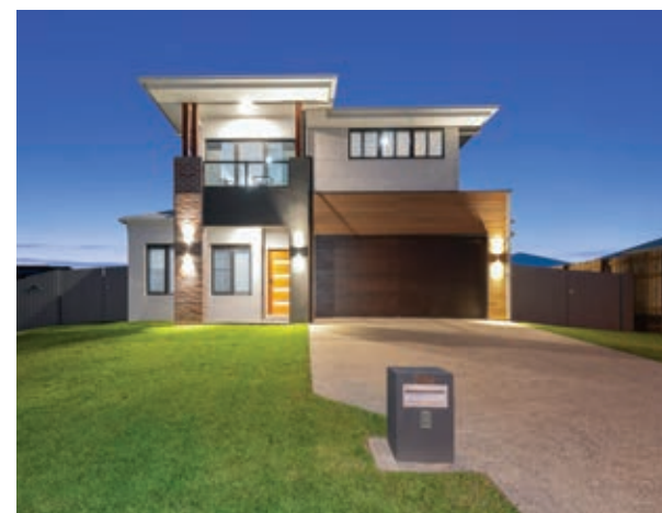
The Ancora 280, Stroud Homes Wide Bay

It has been such an honour to be a judge for HIA the last few years and view such stunning properties and amazing craftsmanship. The winners of the HIA 2020 Awards should be applauded for their outstanding creativity and very high building practices. They are all worthy recipients of their awards.