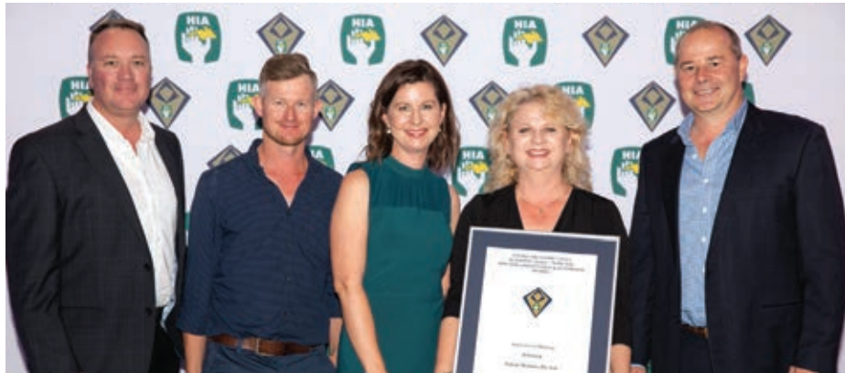
The Saltair team stand proud with their award

Maroochy RSL hosted the annual event on October 16.