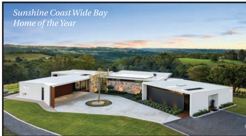
Sunshine Coast Wide Bay Home of the Year